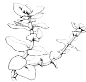
BACOPA ( Bacopa caroliniana ) Round, light green leaves, very ornamental. Predominately an emergent but will grow submersed.