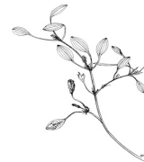
PONDWEED ( Potamogeton diversifolius ) Submersed leaves are thread-like and have a bristlelike point.