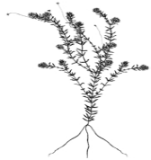
CANADIAN ELODEA ( Elodea canadensis ) Leaves in whorls of 3 and smooth to the touch.

Aquatic plants that grow completely or mostly under water are often termed “oxygenating” or “oxygen” plants by the water garden and aquarium industry because these submersed plants contribute dissolved oxygen to the water during photosynthesis. Dissolved oxygen is important to support fish and other aquatic life. These plants also provide food and cover for fish and other aquatic organisms. The term “Anacharis”, as used by commercial aquatic plant suppliers, includes a variety of oxygen plants that resemble the elodeas. Plants sold under this name include the true Elodeas and two species that are illegal to sell in South Carolina, Brazilian elodea ( Egeria densa ) and Hydrilla ( Hydrilla verticillata ).