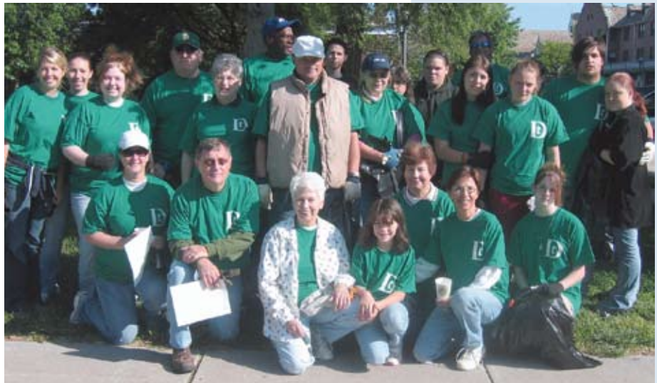
Small beautification efforts (left) and large events like a Team Dundalk cleanup (below) help to make downtown cleaner and greener.