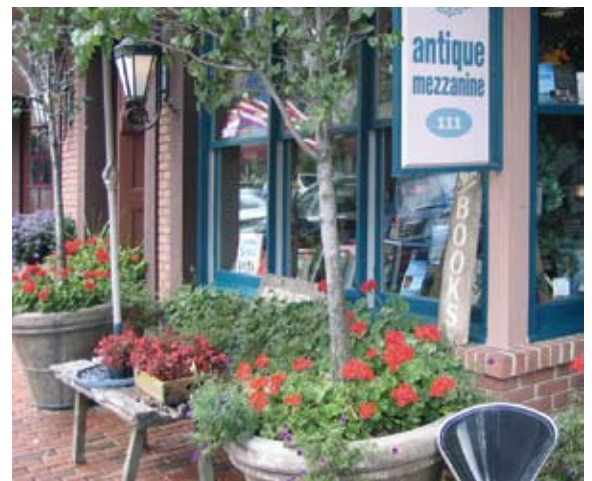
Container gardening in Oakland.