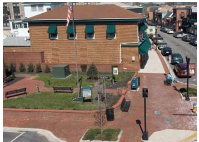
A community green space in downtown Elkton.

Light and Shade: Having too much sun or too much shade can both make open space undesirable for use. Shade and sun should be balanced through the use of trees and building shadows.