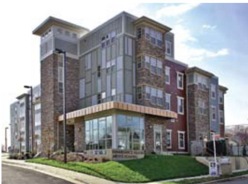
The Renaissance Square building in Hyattsville provides moderate-income housing in a transit-accessible location. It also incorporates several sustainable features, such as green roofs.

Five communities in Maryland are part of the LEED-ND pilot study. These communities are Aventiene/Crown Farm in Gaithersburg, Decker Walk in Baltimore, the East Baltimore Development Initiative, Glenmont Metrocenter in Silver Spring, and Twinbrook Commons in Rockville. More information can be found at www.usgbc.org/LEED/ND/ .