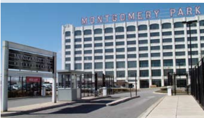
Montgomery Park in Baltimore City

Encouraging the replacement of standard roofing materials with "green" or vegetated roofs can have several long-term benefits. Vegetation retains rainwater, returning a portion to the atmosphere through evaporation and transpiration and thereby cooling rather than heating a building in warm weather, and minimizing heat loss in winter. Other benefits of green roofs include improved air quality, longevity of roofing materials, habitat for wildlife, competitive lifecycle costs, and cleaner stormwater runoff. Green roofs can also help to reduce temperatures in urban areas, which are often several degrees warmer during the summer—a phenomenon known as the "urban heat island effect."