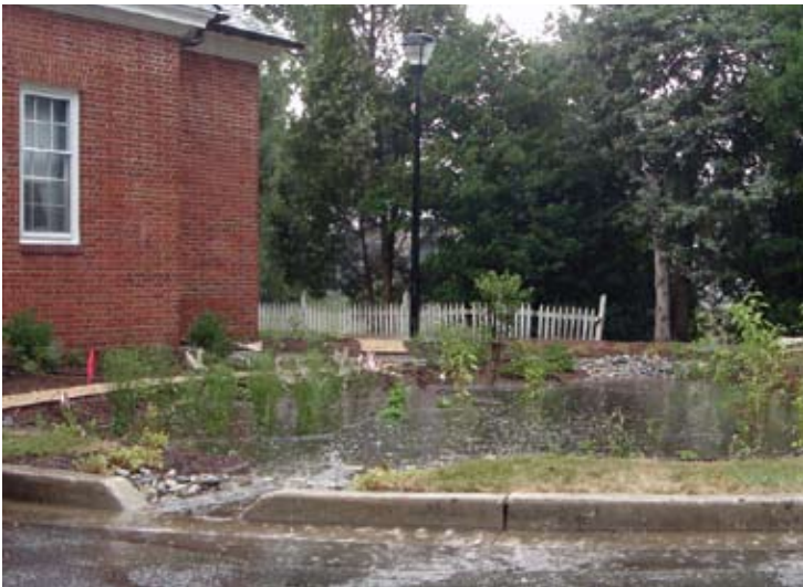
Rain gardens such as this one at the Centreville Library trap runoff and allow it to infiltrate.

Runoff can be slowed by using vegetation in place of impervious surfaces to slow the movement of water. "Micro-scale practices," such as green roofs, pervious pavement, and rain gardens are more compatible with downtowns than other land consumptive ESD techniques. Rain gardens—sometimes referred to as infiltration areas—are planted areas that capture stormwater runoff, allowing water to infiltrate into the soil, rather than running directly into nearby streams. New construction typically pays for stormwater management associated with the development project. The cost of stormwater retrofits—redesigning stormwater systems to fit into Main Street's existing character—is typically undertaken by the local jurisdiction ( see page 16 for funding suggestions ).