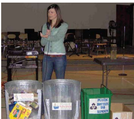
MDE educates communities on how recycling paper, plastic and cans can reduce waste from 7 lbs. to only four items reaching our landfills.