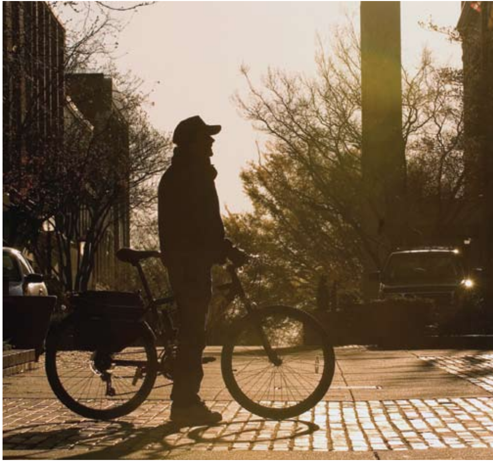
Front and back cover photos, Sam Kittner Photographer