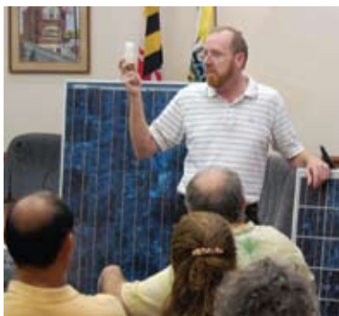
An Energy Conservation Workshop in Mount Airy helped to educate citizens about ways to reduce energy use.