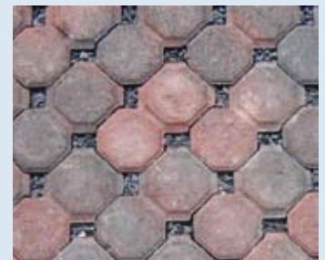
Pervious pavers can reduce impervious surface in developed areas.

FOSC has worked cooperatively with many communities. In Berwyn Heights, FOSC was part of a rain garden workshop that facilitated the installation of a rain barrel and two rain gardens at the Town Hall parking lot. In Takoma Park, FOSC worked with the City to install rain gardens at Forest Park in downtown. In Silver Spring, they worked with the Forest Estates Civic Association to help several homeowners build rain gardens in their yards. In return, the homeowners agreed to maintain the rain gardens and to use them to encourage their neighbors to install rain gardens and rain barrels. The FOSC rain gardens are also intended to educate the community at large about the problems of stormwater runoff and about simple solutions to the problem.