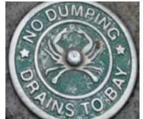
Stormwater from parking lots, roofs, and other impervious surface carries pollutants to the Chesapeake Bay and its tributaries.