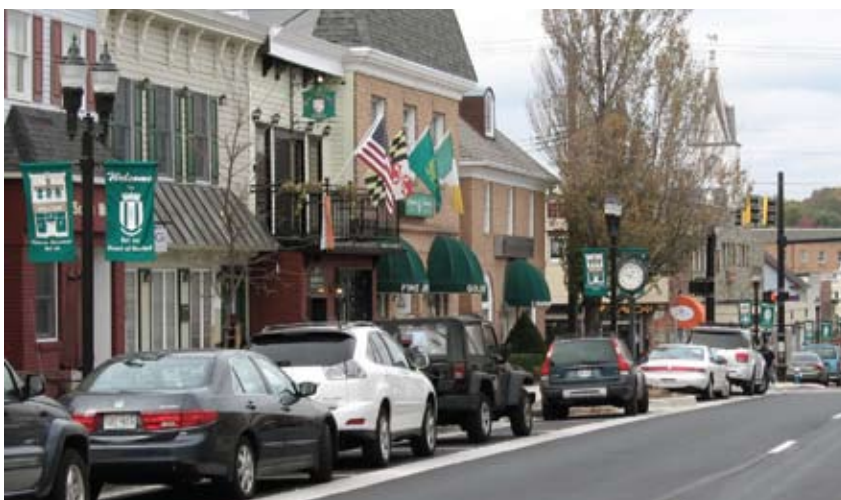
The streetscape project for Main Street in Bel Air accommodates vehicles and parking while upgrading sidewalks and street crossings for pedestrians.

Making Main Street more walkable can require major infrastructure changes, such as the Bel Air Streetscape project described on this page. Such initiatives are best implemented at the municipal or county level. However, individual business owners, employees, and residents can also have an impact. For example, installing bicycle racks in front of businesses can remove one of the major barriers to increased bicycle use. Assisting downtown businesses in creating carpools can reduce the number of cars on the road and make the downtown more pedestrian and bicycle-friendly. Organizations such as BikeWalk and Walkable Communities, Inc. offer walkability audits for communities and workshops to find practical solutions to transportation issues.