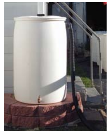
Rain barrels can collect and save rooftop runoff.