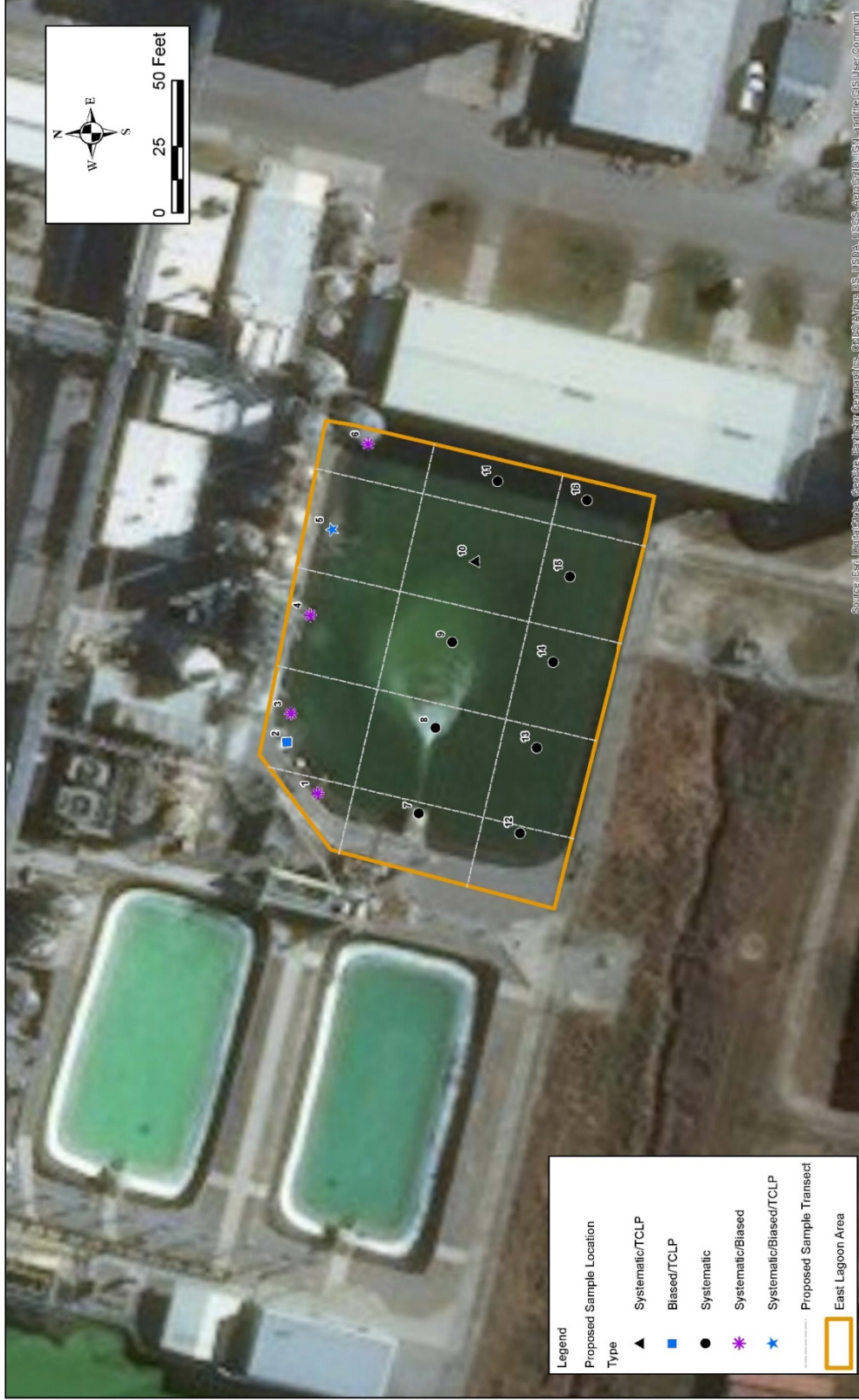
East Lagoon Proposed Sample Locations