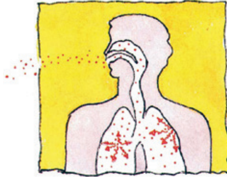
Illustration provided by EPA.

Radon can get into any type of building (homes, offices and schools), which can cause high indoor radon levels. However, you are most likely to get your greatest exposure at home since that is where you spend most of your time.